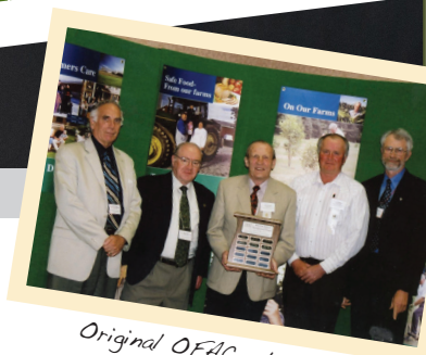
Original OFAC chairs