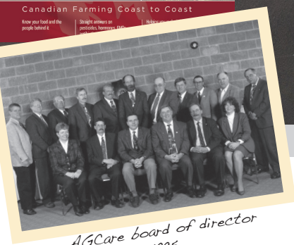
AGCare board of director 1995