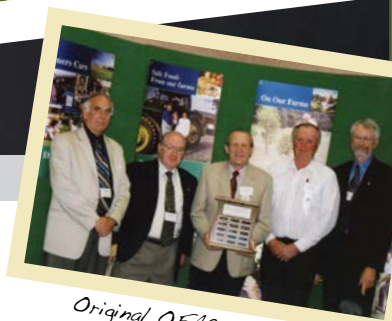
Original OFAC chairs