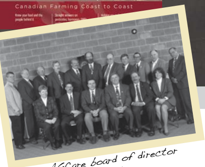
AGCare board of director 1995