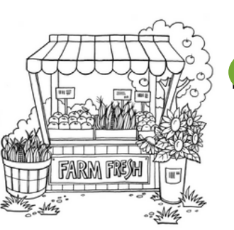
There are over 125 different fruit and vegetable crops grown in Ontari